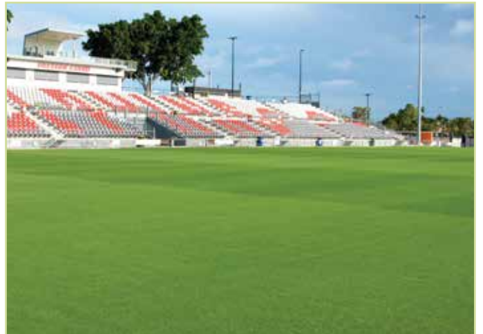
REDCLIFFE DOLPHIN'S STADIUM