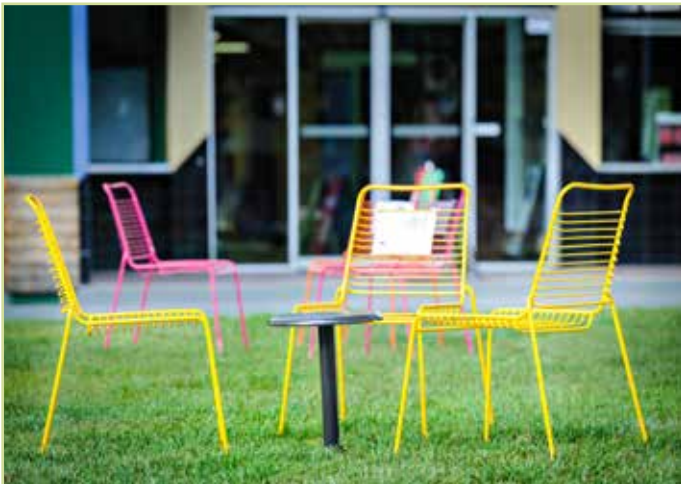
POP-UP LAWN CANBERRA