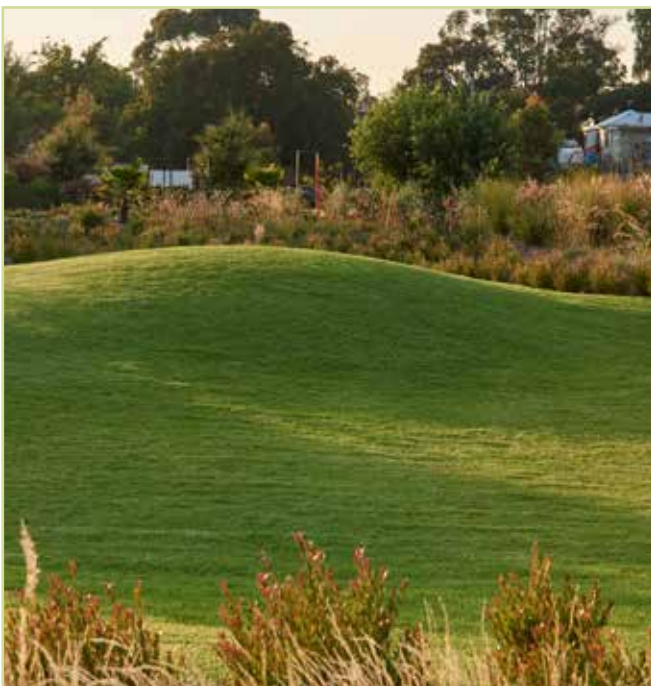
BENDIGO BOTANICAL GARDENS