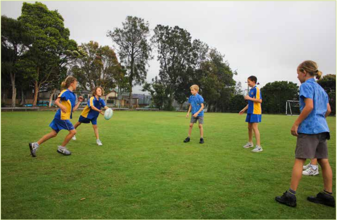
ST COLUMKILLE'S PRIMARY SCHOOL