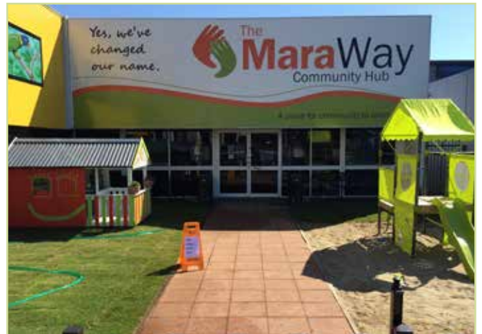
MANUNDA COMMUNITY CENTER