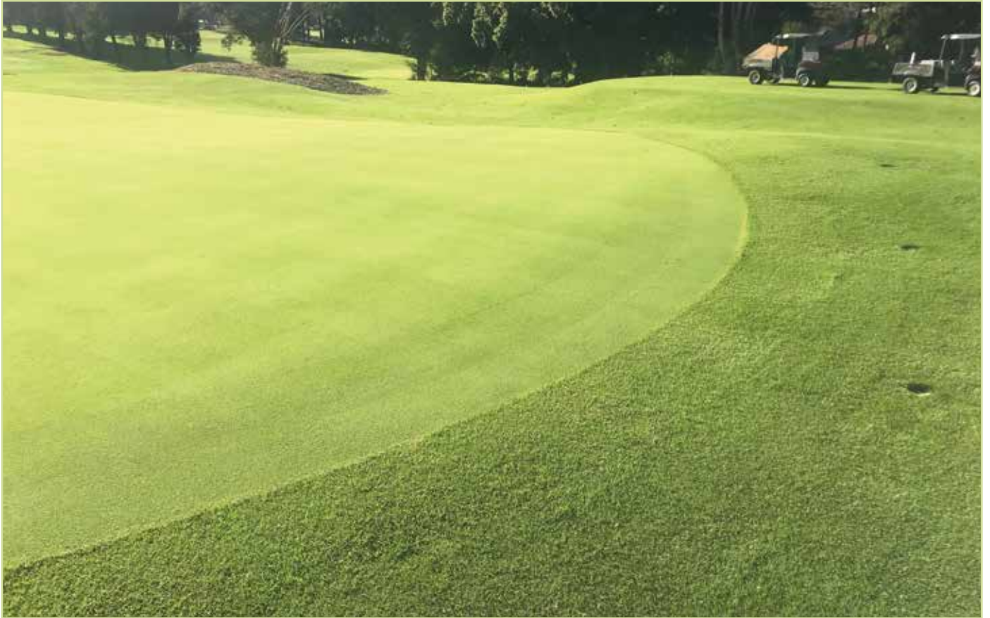
KILLARA GOLF CLUB